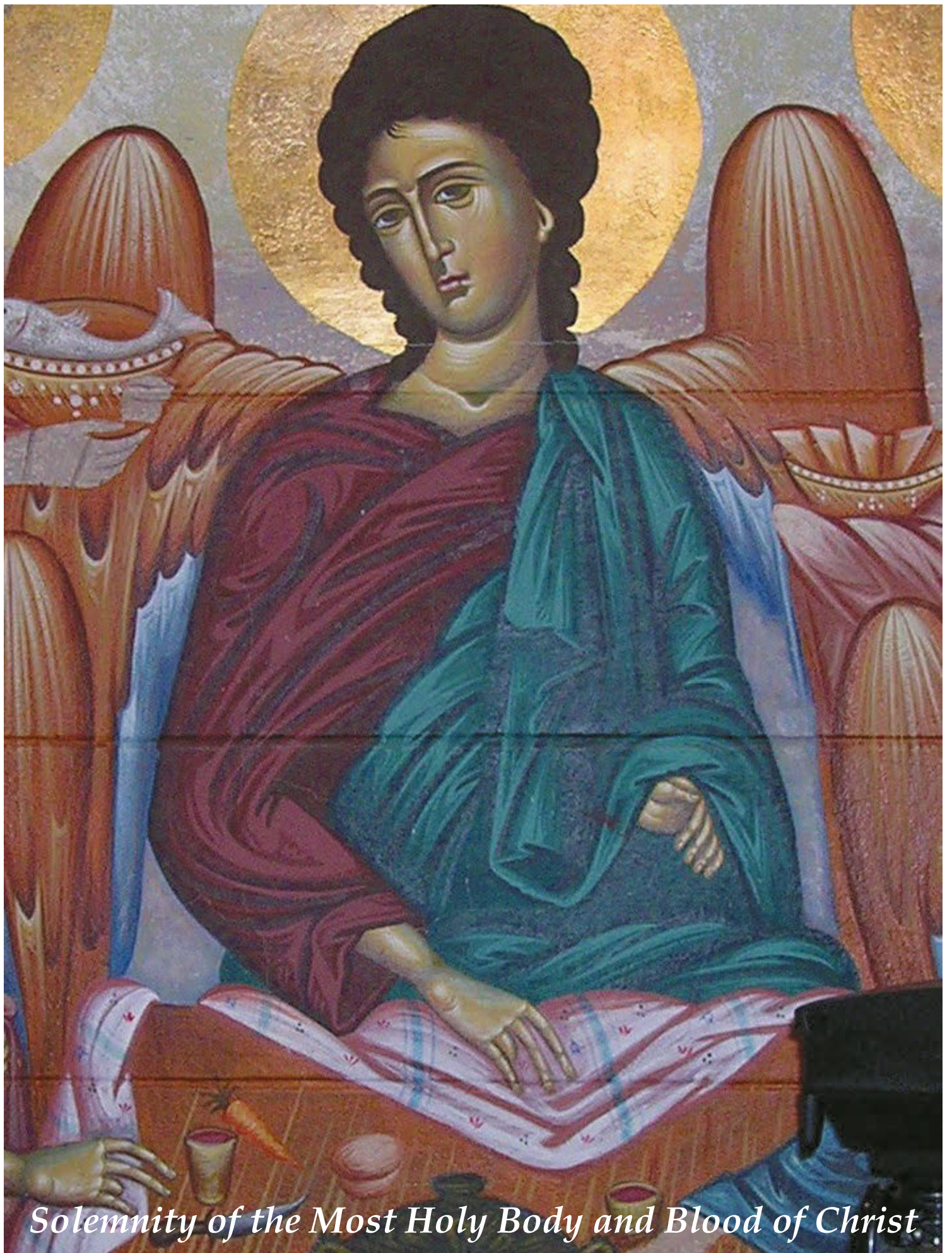
Solemnity of the Most Holy Body and Blood of Christ